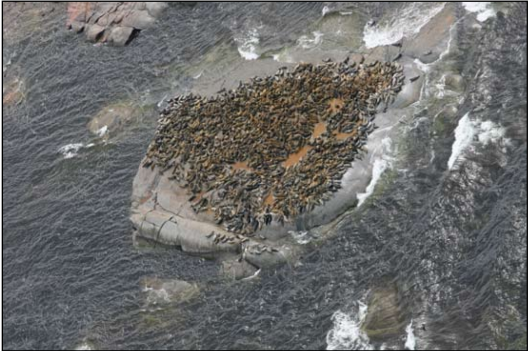
Fig. 1. Grey seals haul out in large numbers to moult in May and early June in the Baltic Sea.

visited during the final year of the study. Photo-id uses re-sightings of animals with distinctive markings as a method for studying population size and movement patterns as well as other population parameters. The technique is non-invasive and relatively inexpensive, compared to traditional tagging methods, and has been used successfully on several whale, dolphin and seal species (e.g. Biggs 1982, Clapham and Mayo 1990, Würsig and Würsig 1997). In this paper we use the results of the photo-id survey to estimate the size of the Baltic grey seal population.